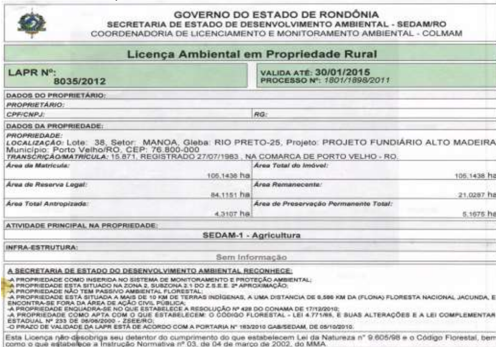
Figure 4 Environmental License

Documentary analysis demonstrates that the private manager of public forests has an obligation to comply with legislation. When errors are found is criminally punished and must indemnify the State. However, was observed during the interviews that there are still many gaps in oversight. The main problem is the amount of police for surveillance.