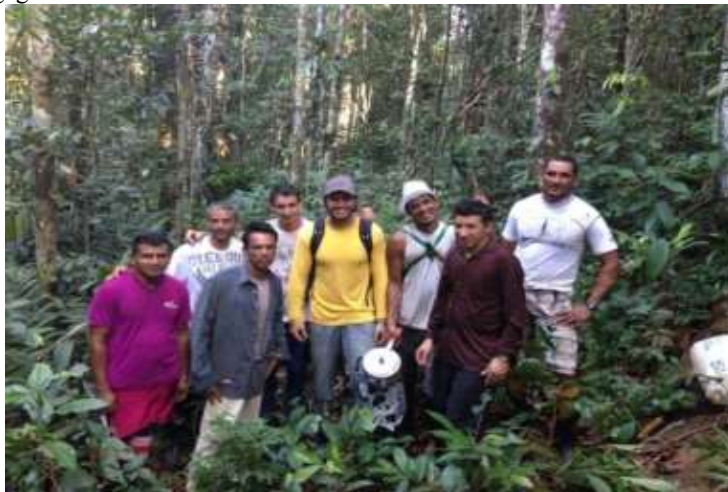
Figure 2 Field Staff

The Figure 2 show the community inserted in place forest work with sustainable management. The effect of employment generates dignity of life and improved the health and education through professional engagement.