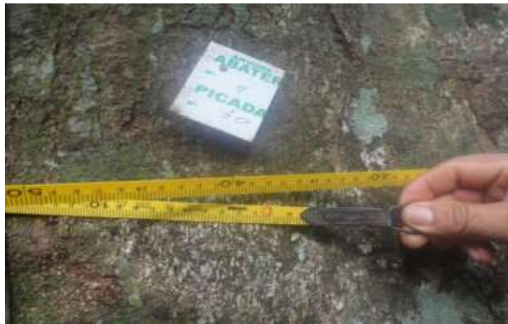
Figure 3 Measurement to Harvest Trees

Documentary analysis demonstrates that the private manager of public forests has an obligation to comply with legislation. When errors are found is criminally punished and must indemnify the State. However, was observed during the interviews that there are still many gaps in oversight. The main problem is the amount of police for surveillance.